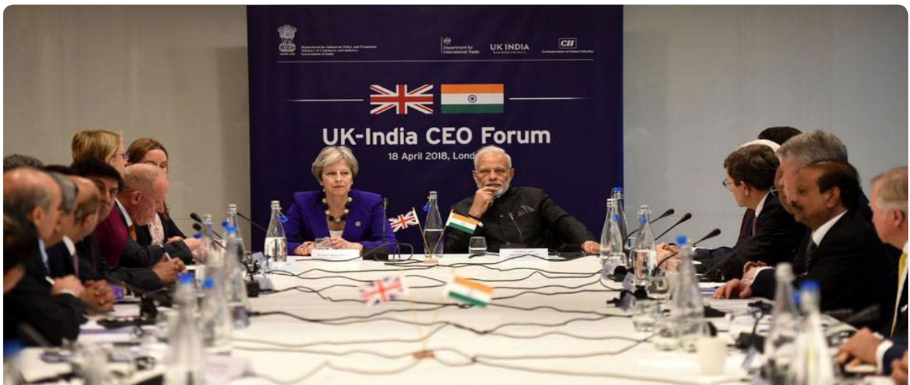
Prime Ministers Theresa May and Narendra Modi with participants during the 2018 UK-India CEO Forum.

This unbeatable potential for collaboration has become core to UKIBC's strategic work connecting business and government as we carry on in 2019.