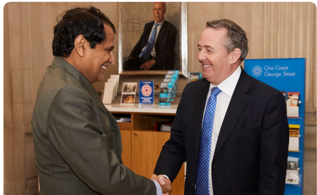
UK Secretary of State for International Trade, Rt. Hon Dr Liam Fox MP, and the Indian Union Minister for Commerce and Industry, Shri Suresh Prabhu meet for the first time at the January JETCO.

A headline outcome from the Advanced Manufacturing and Technological Collaboration working group was the agreement to establish a joint Centre of Technological Excellence in India. This was further advanced at the India-UK Future Tech Festival in Delhi in December 2018 when the UKIBC and CII organised a roundtable for top business leaders, government officials and a UK-India Manufacturing Catapult Centre to drive the initiative forward.