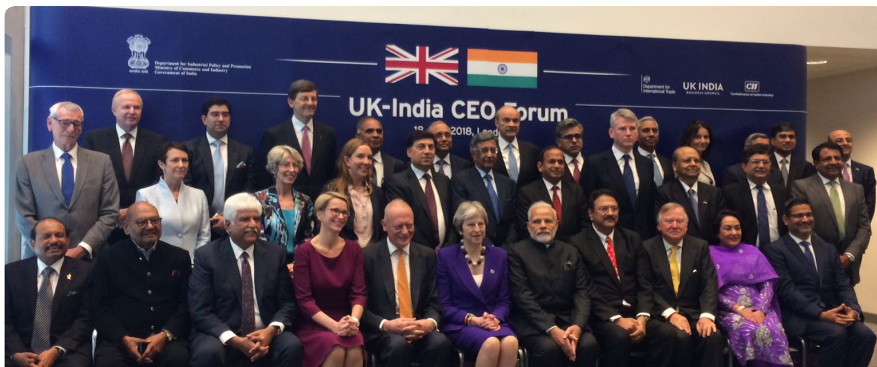
Prime Ministers Theresa May and Narendra Modi with participants during the 2018 UK-India CEO Forum.