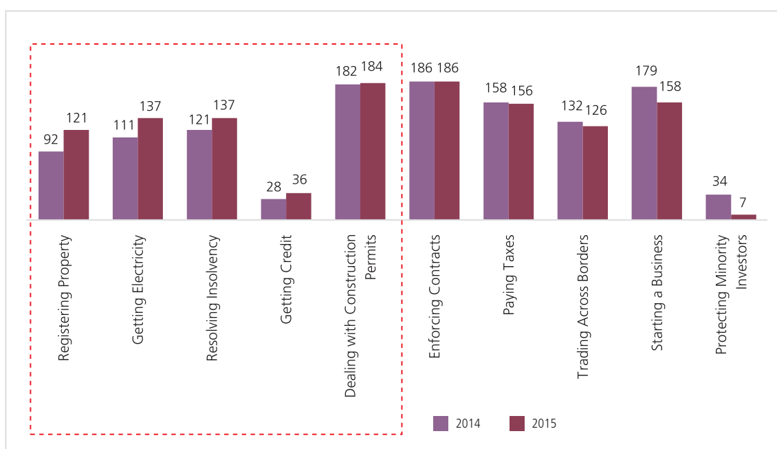
India's Ranking on Sub-indices in 2014 & 2015